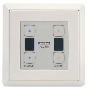
Volume and source